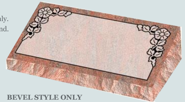
BEVEL STYLE ONLY